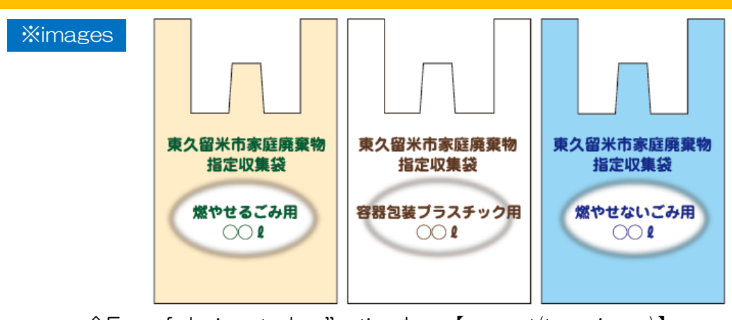
♦Fee of designated collection bag [per set(ten pieces)]

From October 1st 2017, burnable garbage, non-burnable garbage, plastic containers/packaging are to be separated into separate designated collection bags.