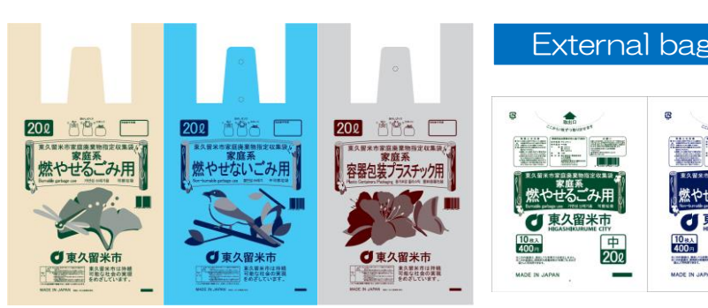
♦ Fee of designated collection bag (per set(ten pieces))

Burnable garbage, non-burnable garbage, plastic containers/ packaging are to be separated into separate designated collection bags.